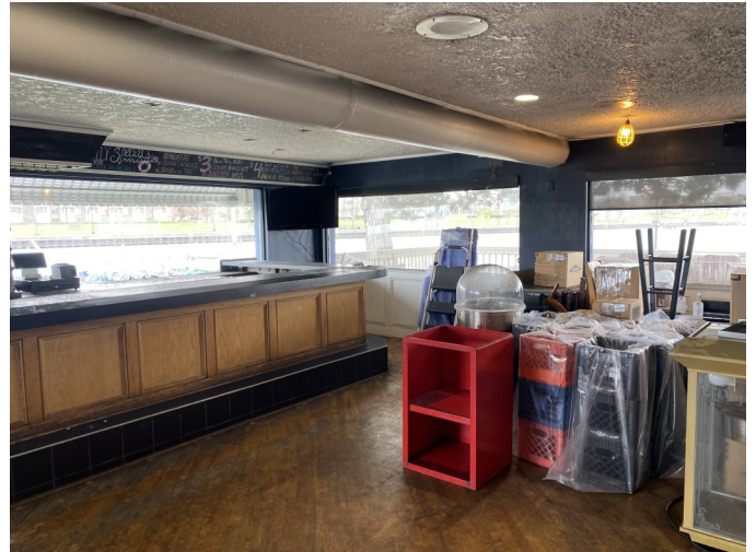
Lights on in the bar area!