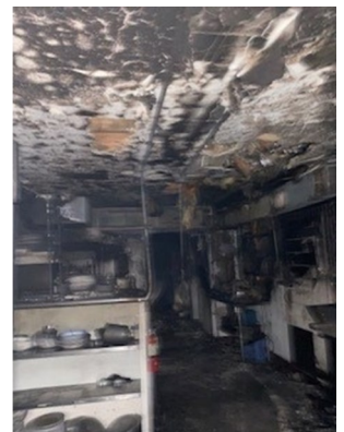
The kitchen the day after the fire.