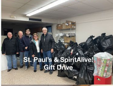
St. Paul's & SpiritAlive! Gift Drive