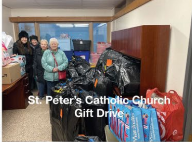
St. Peter's Catholic Church Gift Drive