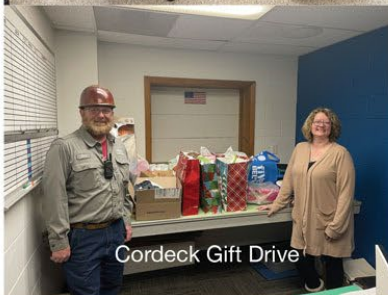
Cordeck Gift Drive