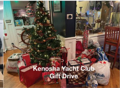
Kenosha Yacht Club Gift Drive