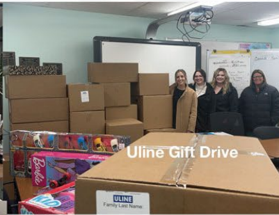
Uline Gift Drive