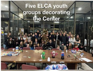
Five ELCA youth groups decorating the Center