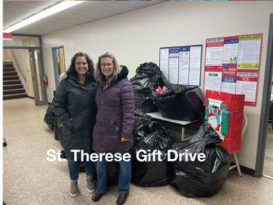
St. Therese Gift Drive